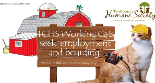
Tri-County Humane Society occasionally receives cats that do not make good indoor pets. These cats prefer earning their rent by assisting with pest control in barns or shops. All "working cats" are spayed/neutered and